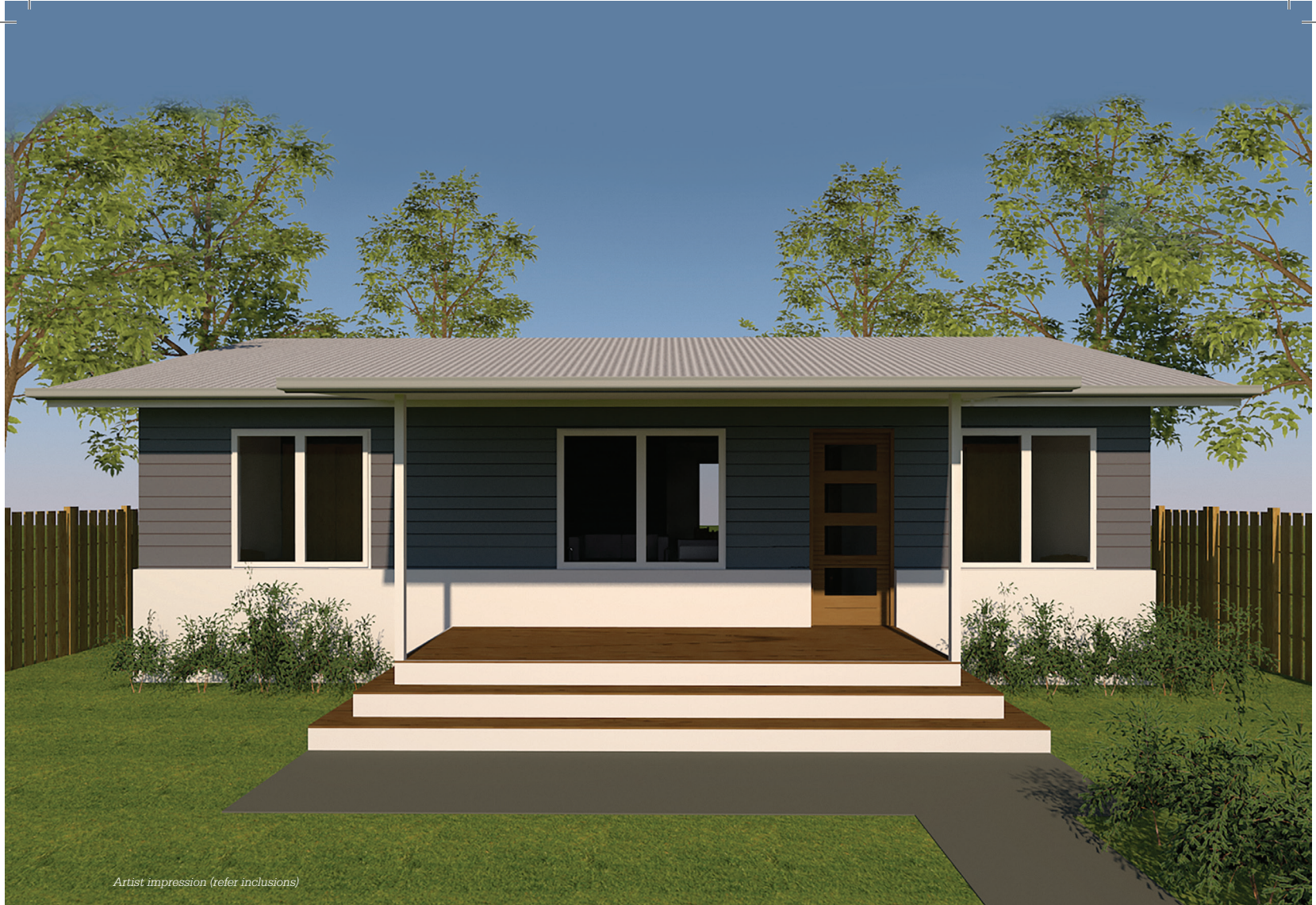
Artist impression (refer inclusions)